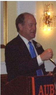
Congressman Bobby Bright